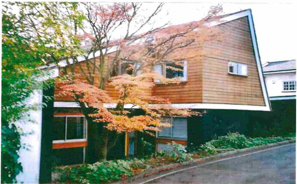
Figs 17 & 18