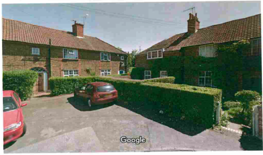
Figs 8 & 9

2.6.8 Recommendation: Borough Plan Advisory Committee agreed to recommend the addition of Rodney Place to the Local List.