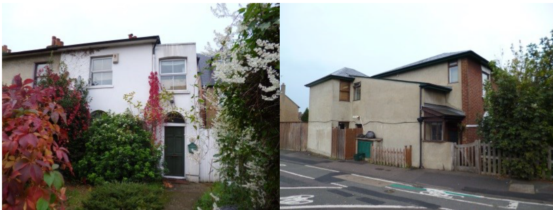
Figs 19 & 20